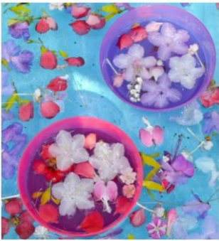
Flower Soup for toddlers

https://fitnessbythesea.com/101-summer-activities-for-kids/