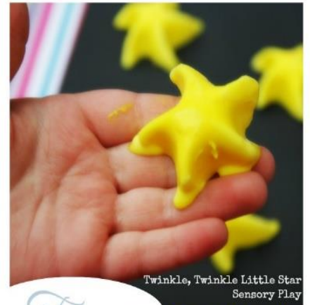
Twinkle, Twinkle Little Star Sensory Play