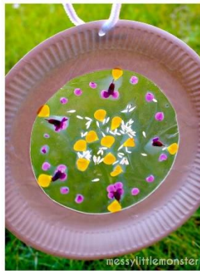
Flower Petal Suncatcher